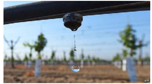
A drop worth fighting over?

everything together. Two markets for trading have been created: one in which shares are exchanged, and another for allocations of water in a given year. The idea is not a new one. In places such as Oman, aflaj systems involve villages trading in shares and in minutes of water flow.