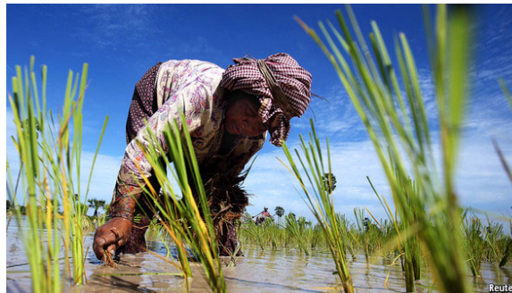
Seeding the next revolution

High domestic prices also tend to drive up local wages, reducing the competitiveness of manufacturing and making rural labour dearer. And by making rice farming a safe bet, the policies blunt entrepreneurship in agriculture too, reducing farmers' incentives to invest in new machinery and new ways of farming. On balance, therefore, artificially high rice prices make the new generation of seeds attractive, but by less than one might expect.